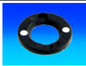
9576246 Washer for Magnetic Navel 1.5mm