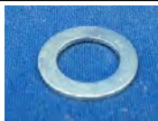
9591393 Washer for Navel 16 x 10.3 x 1