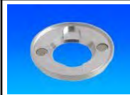
10400808 Aluminum Washer for Magnetic Navel 1.5mm