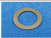
2220029 Washer for Navel 16 x 10.3 x 0.5